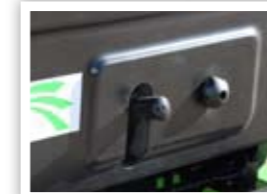
TURNTABLE CONTROL LEVER