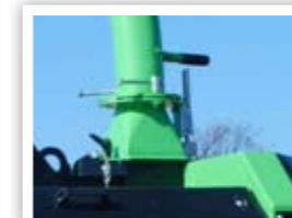
DISCHARGE CHUTE ROTATION