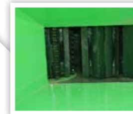
LARGE FEED CHUTE